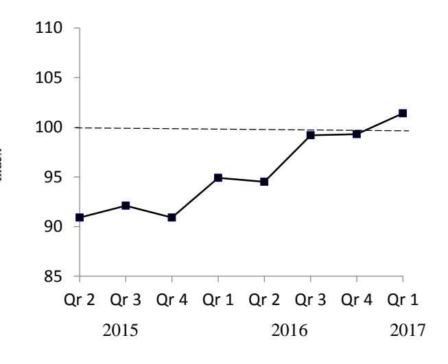
Figure 2 and Table 7 show the movement of PPI-A covering the periods 2015, 2016 and 2017 on a quarterly basis.

The overall index for the first quarter of 2017 went up by 2.1% compared to the previous quarter and rose by 6.8% compared to the corresponding quarter of 2016. Percentage changes on a quarterly basis and the net contributions of commodity groups and products are given in Table 8.