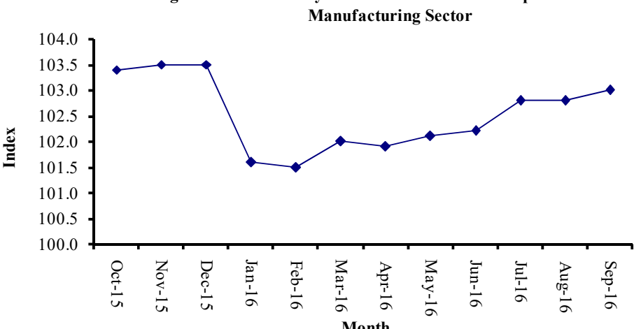
Fig 1: Overall monthly indices: October 2015 - September 2016

On a monthly basis, the PPI-M gained 0.6 point (+0.6%) in July 2016, remained unchanged in August 2016 and gained 0.2 point (+0.2%) in September 2016 (Table 1a).