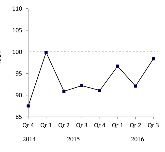
Figure 2 and Table 7 show the movement of PPI-A covering the periods 2014, 2015 and 2016 on a quarterly basis.

The overall index for the third quarter of 2016 went up by 6.8% compared to the previous quarter and rose by 6.7% compared to the corresponding quarter of 2015. Percentage changes on a quarterly basis and the net contributions of commodity groups and products are given in Table 8.