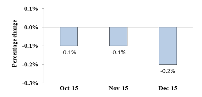
Chart 2: Percentage change from previous month

Compared to the corresponding months of the previous year, the index shows overall increases of 1.6% for October 2015, 1.5% for November 2015 and 1.4% for December 2015 (Table1.3).