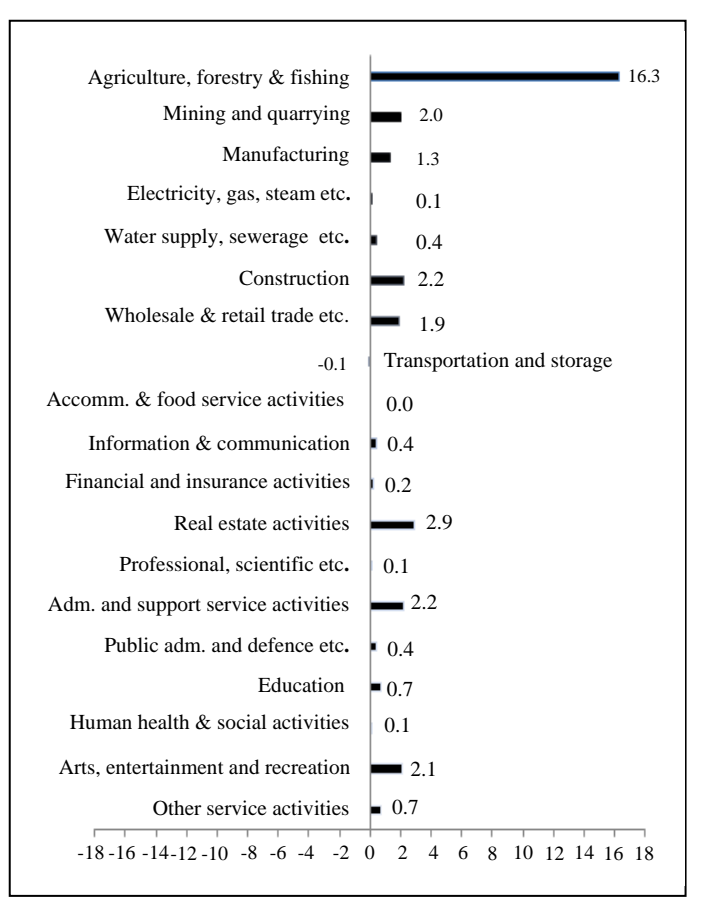
Chart 1: % Change in Wage Rate Index from Quarter 1 2015 to Quarter 2 2015

The wage rate index for the General Government sector which comprises Ministries, Government departments and agencies operating under them, municipalities, district councils and Rodrigues Regional Assembly increased by 0.4% to reach 136.9 in the second quarter 2015 from 136.3 in the first quarter 2015. This sector which accounts for around 32% of the total weight of the wage rate index contributed 0.2 points to the overall change of 1.4 points in the index.