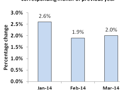
Chart 3: Percentage change from corresponding month of previous year

Compared to the corresponding months of the previous year, the index shows overall increases of 2.6% for January 2014, 1.9% for February 2014 and 2.0% for March 2014 (Table 1.3).