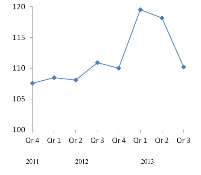
Figure 2 and Table 7 show the movement of PPI-A covering the periods 2011, 2012 and 2013 on a quarterly basis.

The overall index for the third quarter of 2013 declined by 6.8% compared to the previous quarter and dropped by 0.6% compared to the corresponding quarter of 2012. Percentage changes on a quarterly basis and the net contributions of commodity groups and products are given in Table 8.