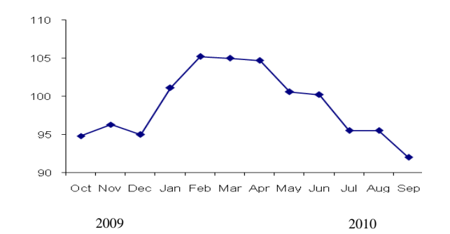
Fig 1: Overall monthly indices, Oct 2009 - Sep 2010

Figure 1 shows the monthly evolution of PPI-A for the period October 2009 to September 2010.