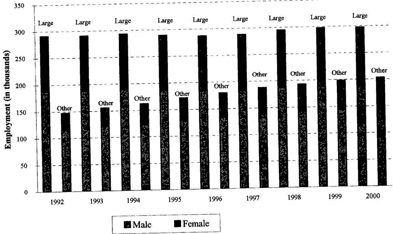
Fig 4 - Employment by industry, 2000