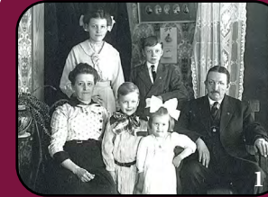
Europeans, whites, mixed and coloured

1901 Around 374,000 persons were enumerated and classified as: