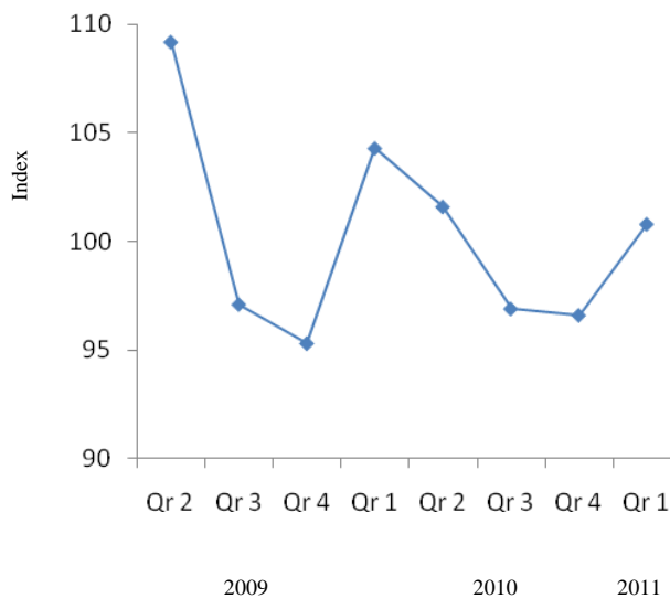
Fig 2: Overall quarterly indices, 2 nd quarter 2009 – 1 st quarter 2011

Figure 2 and Table 7 show the movement of the PPI-A covering the period 2009, 2010 and 2011 on a quarterly basis.