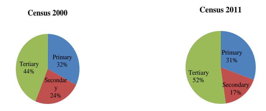
Employed persons aged 16 years and over by sector, 2000 and 2011 Censuses

In 2011, the tertiary sector provided jobs to 52% of workers, up from 44% in 2000. By contrast, the secondary sector is losing ground with a decrease from 24% to 17% and the primary sector remained almost unchanged at 32% - 33%.