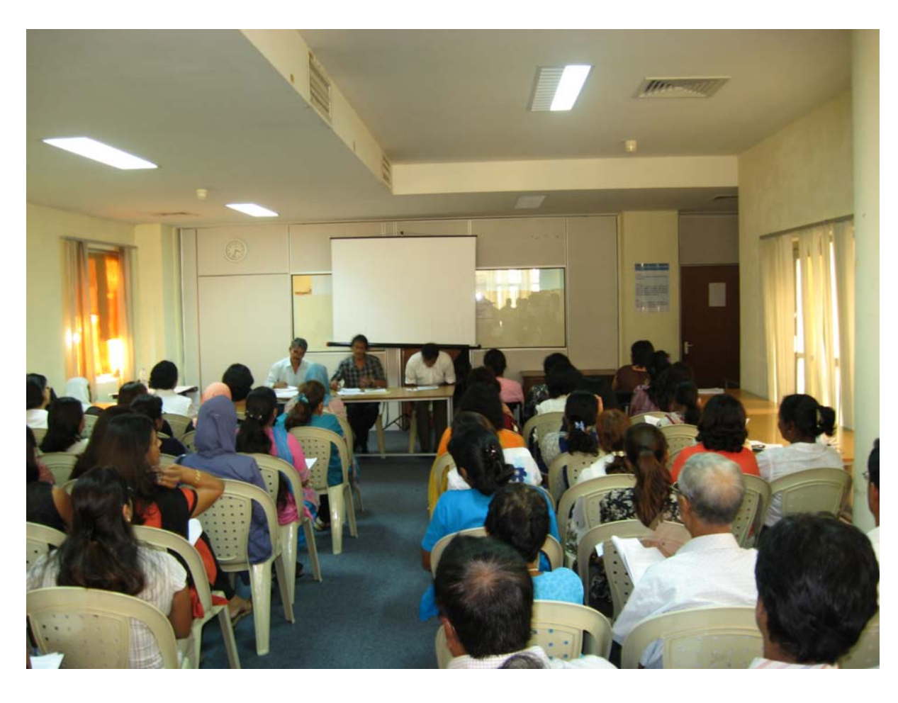
Annual General Meeting of Central Statistical Office Staff Association held on 1 April 2009