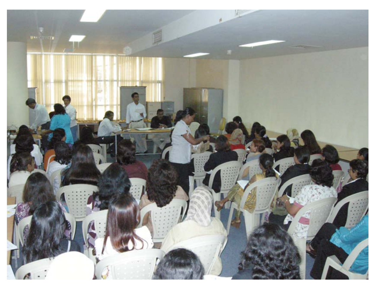
Annual General Meeting of Central Statistical Office Welfare Association held on 24 June 2009

The CSOWA held its Annual General Meeting on 24 June 2008. The President pointed out that many activities have not been organised in year 2008 due to a low participation of members. The 2008 end-of-year party was held at 'Le Coco Beach Hotel' and the participation turnover has improved compared to previous years. He made a request that the collaboration of all members is needed such that we can move ahead with activities.