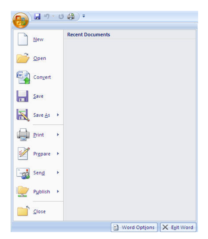
Figure 2: The "Word Options button"

Another method is to click on the Office Button and then Click on the "Word options" button (figure 2). This brings up the "Word options" dialog box. Click on "Customize" and then select the feature you would like to add on the Quick Access Toolbar by clicking the "Add" button (figure 3). You can change the order of the buttons by highlighting a button on the right side of the screen and using the Up and Down arrows to move it.