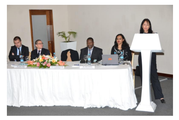
SM director delivering the welcome speech

To mark IYS 2013, SM hosted a half-day event on Monday 23 September 2013 at Hennessy Park Hotel, Ebène. On that occasion, SM unveiled its logo and launched the Code of Practice for Official Statistics as well as the Interactive Statistical Data Portal in front of a wide spectrum of stakeholders from African Development Bank (AfDB), COMESA, government ministries and departments, Bank of Mauritius, Financial Services Commission, private sector, academia, NGOs and the media.