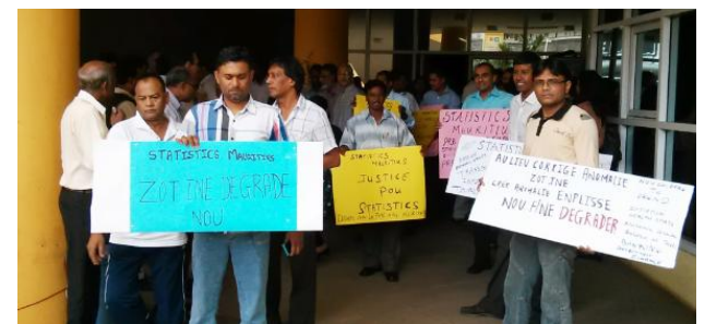
Stats M staff protesting against the EOAC 2012

The Errors, Omissions and Anomalies Committee (EOAC) Report on the PRB Report 2013 created some frustration among Stats M staff who felt that grades within the office have been downgraded relative to other ministries and departments.